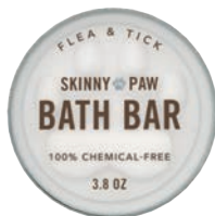
Flea & Tick MSRP: $10

*1 bar = 3 bottles! | Delivers value and reduces carbon footprint Follow with Skinny Paw Hemp Towel to remove excess water from coat.