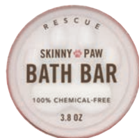
Rescue MSRP: $10