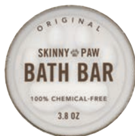
Original MSRP: $10

Scrub with love! Nourishing virgin coconut oil is the base for this ultra-lathering shampoo bar, giving your pet a healthy, shiny coat without stripping away natural oils. Thoughtfully created with both pets and caregivers in mind, the bars allows you to keep one hand on your pet at all times, and the lid conveniently doubles as a soap dish.